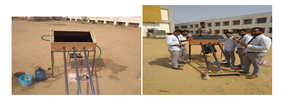
Figure 2. Experimental Setup of Solar Still with Evacuated Tubes