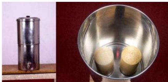
Fig. 3 Ceramic Water Filter

Desalination is process primarily done in developed countries with enough money and resources. If technology continues to produce new methods and better solutions to the issues that exist today, there would be a whole new water resource for more and more countries that are facing drought, competition for water, and overpopulation. Though there are concerns in the scientific world about replacing our current overuse of water with complete reliance on sea water, it would undoubtedly be at least an option for many people struggling to survive or maintain their standard of living.