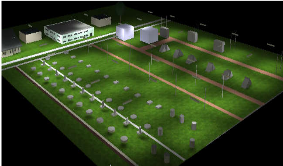
Fig 3 Design in DIALux Software using LED