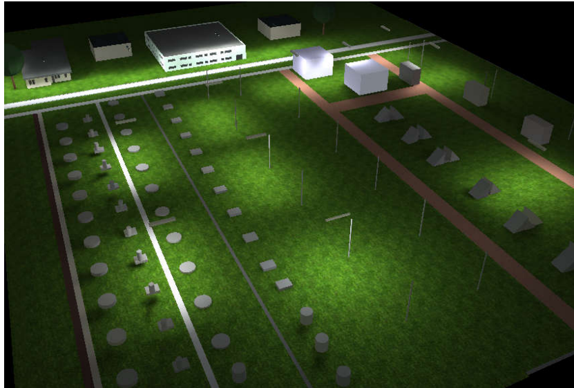
Fig 1 Design in DIALux Software

The software interface was used to design the lighting in the substation. The conventional lights are placed at different locations in the substation and the values are obtained for the particular section. The thing that was kept in mind was that the LUX required is being maintained or not. Now here we have tried to place the lights on the location as been displayed in the switchyard taken for the case study in order to obtain the output and would help us get the number of lights required in the substation.