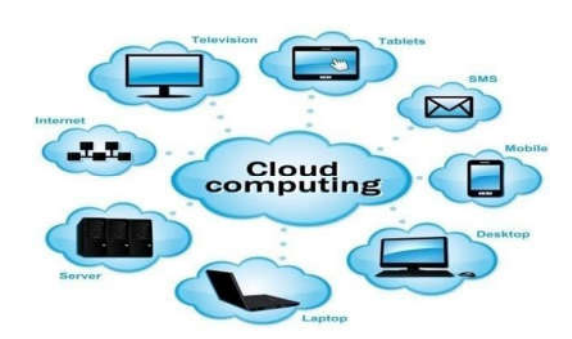
Figure 1: General Structure of Cloud Computing