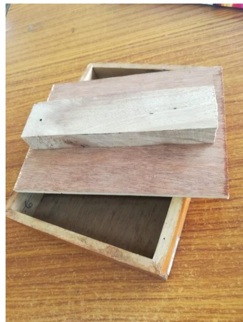
Fig. 3. Compressor