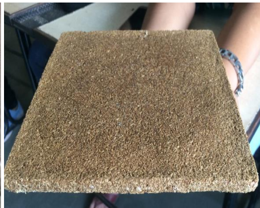
Fig 5. Final Product