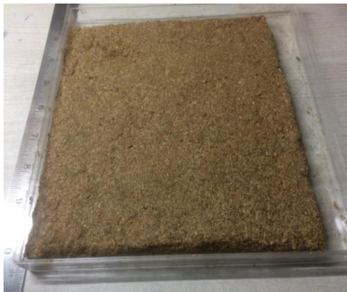
Fig 4. Before drying

The heating source is turned off and the finely ground rice husk is added to the adhesive mixture and it is stirred continuously till the rice husk purely blends with the adhesive. The slurry thus formed is poured into the mould. The mixture is leveled using a flat faced spatula and then compressed with the wooden compressor. Hydraulic compressor can also be used. But the so formed wooden compressor is specially designed for the particle board and hence it helps in compressing the mixture to a very finite level without developing cracks. The compressed composite is now allowed to dry for 24 hours. Heating in a microwave oven can reduce the time duration required for drying. Fig. 4 shows the model in process and Fig 5 shows the Final product.