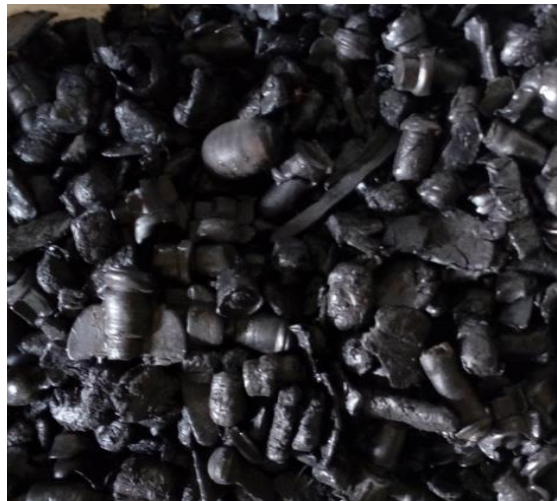
Figure 2.1 Plastic material used in this work

Plastics gathered from the transfer territory were arranged to get the prevalent one. These were squashed into little division and washed to expel the outside particles. At that point it was warmed at a specific temperature with the goal that the vital weakness was gotten. After expulsion the liquid plastic was chilled off and gathered in rocks of 20 mm measure roughly. These plastic stones were squashed down to the measure of totals. These plastic boulders were crushed down to the size of aggregates.