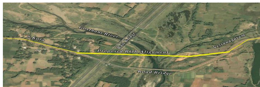
Fig.2: Proposed road over bridge alignment

Instead of continuation of the existing ROB across Gosthani river over the railway line also a new alignment is proposed due to insufficient place between the railway track and present bridge to maintain sufficient slope, a new ROB is proposed. The proposed new alignment covers both the rail track and river course and is shown below. The