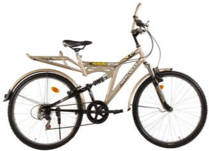
Fig 6 Hercules rebellio 619 model bicycle.