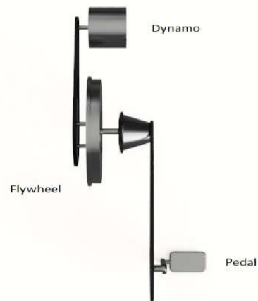
Fig 5 Schematic of transmission, top view