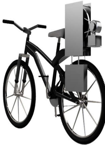
Fig 3 Assembled view, left view