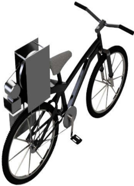
Fig 2 Assembled model, right view

in the figure. Fig. 3 shows the left view of the assembled model, the flywheel frame to mount flywheel, battery frame to accommodate batteries and the dynamo placement can be seen.