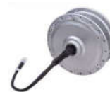
Fig 10 Hub motor.