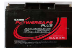
Fig 9 Dry lead acid rechargeable battery.

Rating: 12V 17Ah Type: Sealed lead acid Quantity used: 4 numbers