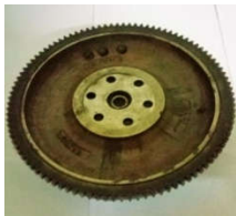
Fig 7 Flywheel.