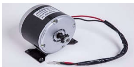
Fig 8 Flywheel.