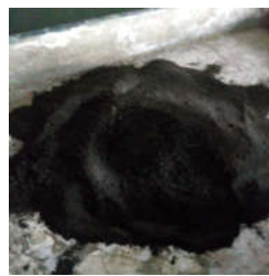
Fig 1 Hot Mix Plant Filler Material Particles (HMPFM)

2.2 Hot Mix Plant Filler Material: HMPFM is the product obtained from the whole process of bitumen plant. It is raw material of the HMPFM in the form of fine particle. This is the very fine particles. The aggregates are used in the bitumen for the construction of roads, and the finest particles which are not used called as HMPFM. This is not used anywhere or in any construction purpose. HMPFM is black in color which is very fine of powdered form. This Material does not have the binding property.