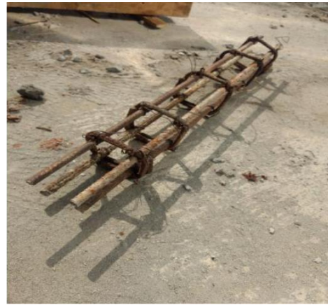
Figure 4. Reinforcement Detail