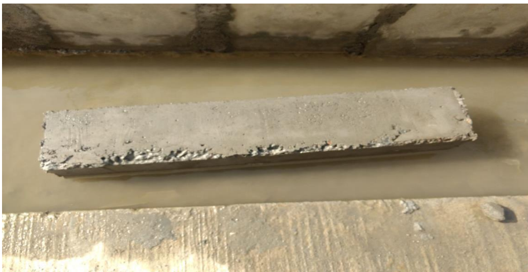
Figure 5. Casted Beam being cured