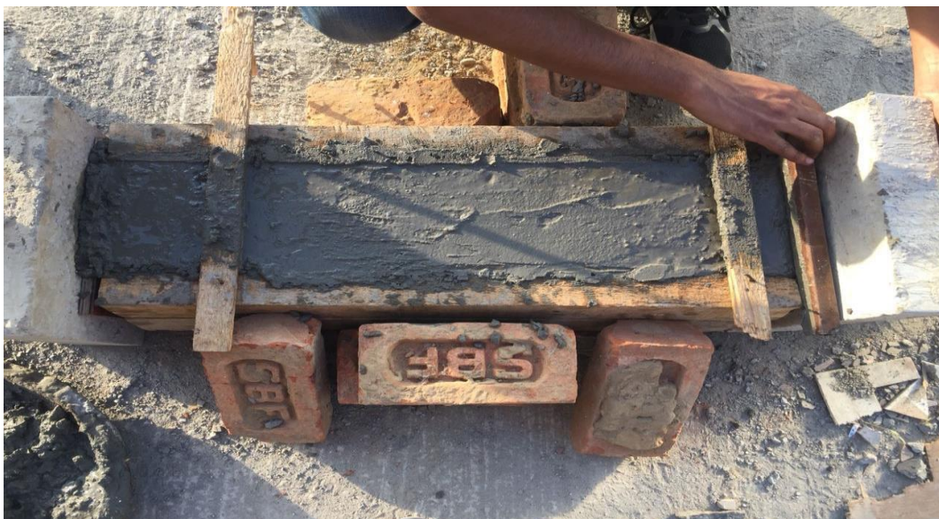
Figure 6. Casted Beam