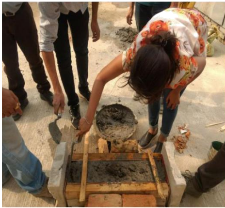
Figure 3. Beam Casting